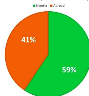
ACHIEVEMENTS BY GEOGRAPHICAL LOCATION OF THE POSITIVE PROGRESS AND EXCELLENCE OF NIGERIA & NIGERIANS [JULY - DEC 2019]

For detailed information on this analysis and identification, kindly visit our website as we will appreciate having your engagements and contributions. Thank you!